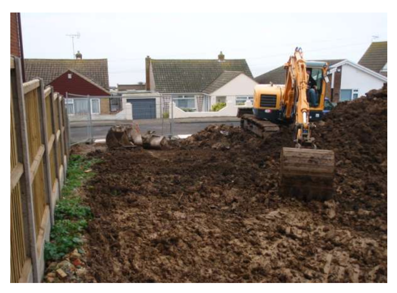
Plate 3. View showing reduction of site