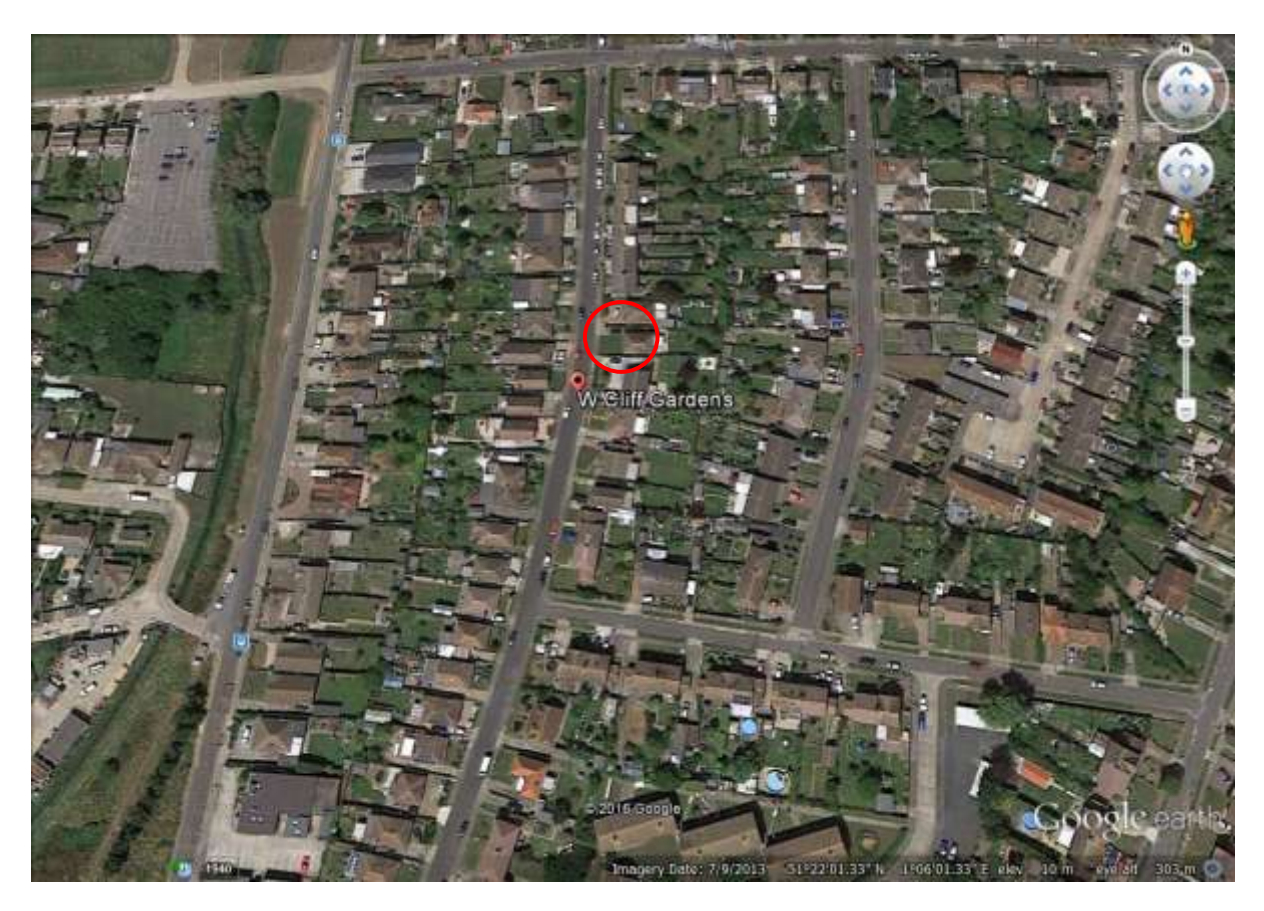
Plate 1. Aerial view of site (red circle) showing the site prior to development.

(Google Earth 07/09/2013: Eye altitude 303m).