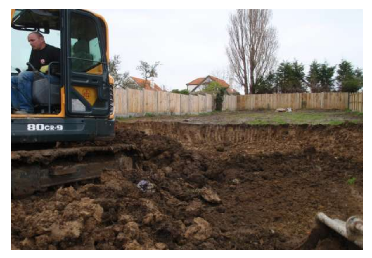
Plate 4. The site showing ground reduction